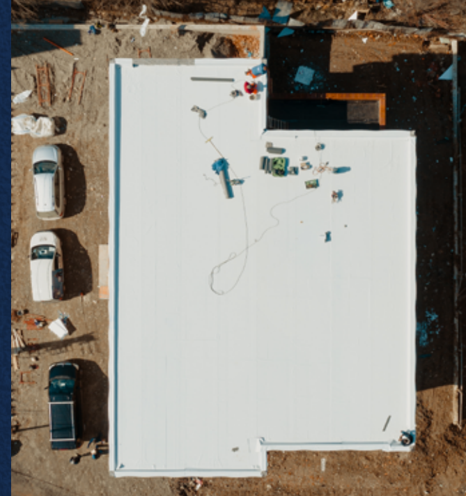
THERMOPLASTIC POLYOLEFIN (TPO)